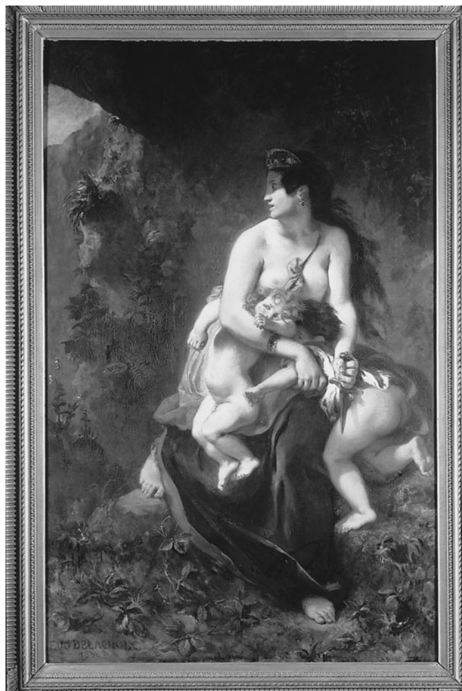
1. Delacroix's Medea: a hunted animal