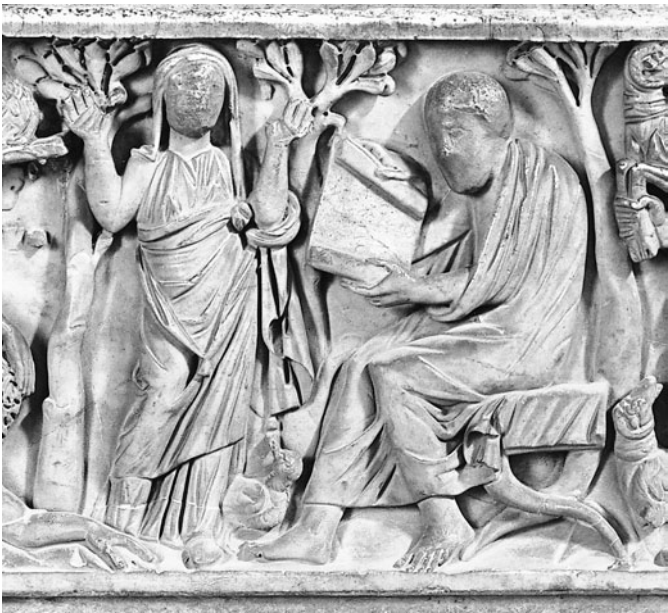
9. On a Christian tomb, a philosopher sits next to a praying figure

When did it all begin? (and what is it anyway?)