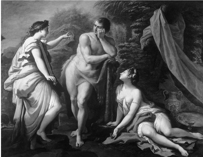
4. Heracles deciding between austere Virtue and tempting Pleasure