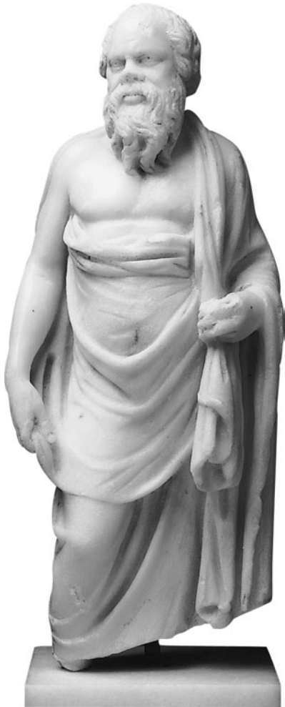
5. The image of Socrates: physically ugly, intellectually an enchanter