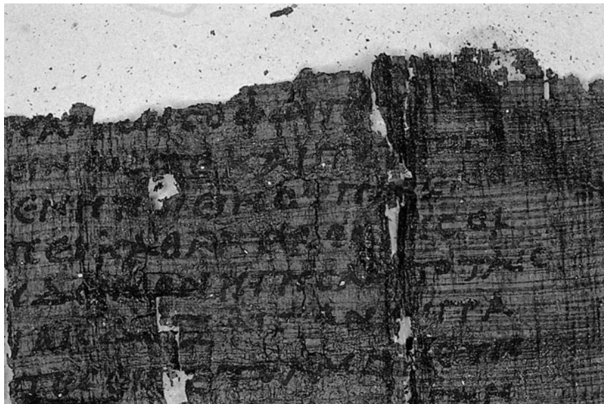
3. A papyrus fragment of a work on anger by the Epicurean Philodemus