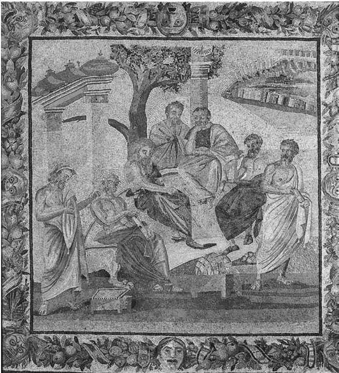
8. Philosophers discussing and arguing together